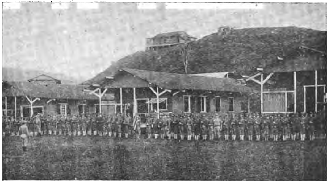
U.S. Marines drilling at Camp Elliott, Canal Zone, Panama.